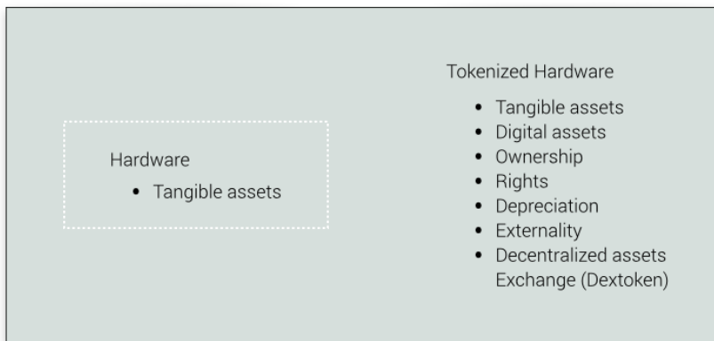
Fig. 2. The Tokenized Hardware

These benefits come from using the utility tokens previously described, and utility tokens are generating with the IMO model. The tokens are publicly accessible via the Dextoken platform, and the platform can provide extra information about the tokenized hardware, such as manufacturing date and product model. Therefore, the Dextoken can also replace the traditional hardware labels.